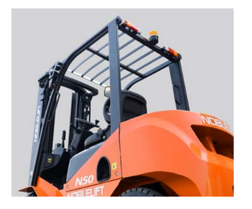
Heavy-duty steel chassis, axles, mast and overhead guard deliver high strength and stability for high lifting heights and heavy loads.