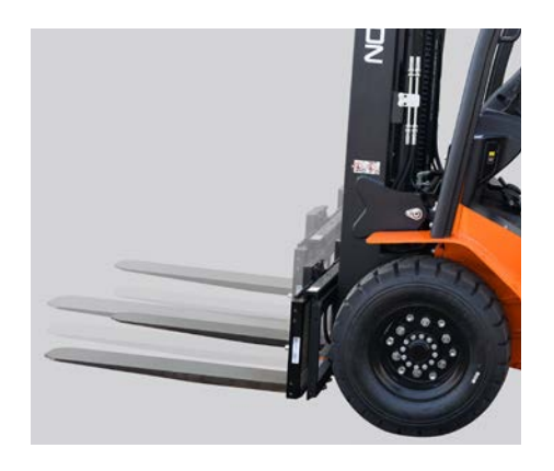
Intelligent buffering effectively protects the ground and cargo from damage while forks descend to the ground.