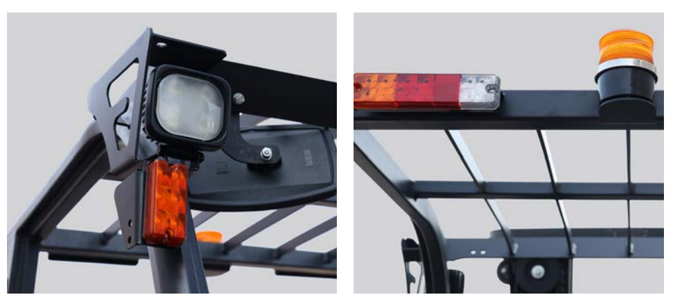
Equipped with LED lamps: LED rear work lights, headlights, strobe and safety blue light. Bright light with low power consumption provides excellent visibility.

The angle of the steering column is easily adjusted with a lever on the left-hand side of the steering column.