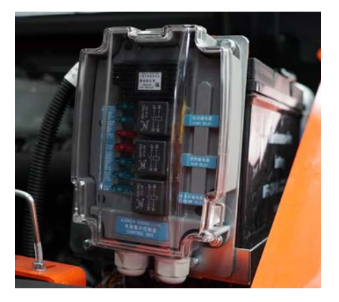
Durable controller that integrates all electrical components is protected from temperature, water and vibration.

Cast axles increases the bearing load and improves the truck structure, while prolonging vehicle service life.