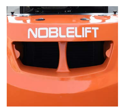
Angled exit ports direct engine air away from the operator and the cab to help operators stay cool.

(2) USB connectors for charging and powering of additional devices during operations.