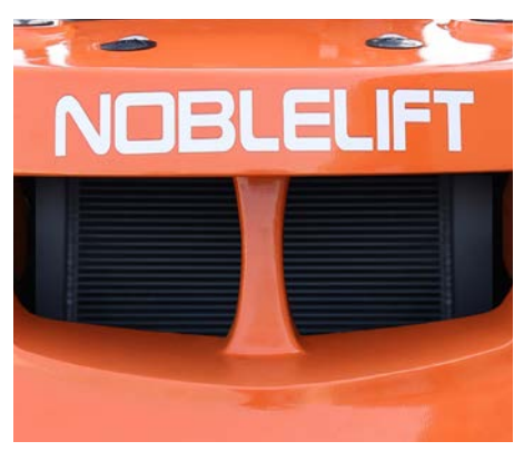
Radiator's plate fin heat dissipation system keeps engine running reliably, even in the most demanding applications.